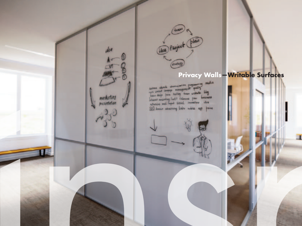
Privacy Walls—Writable Surfaces